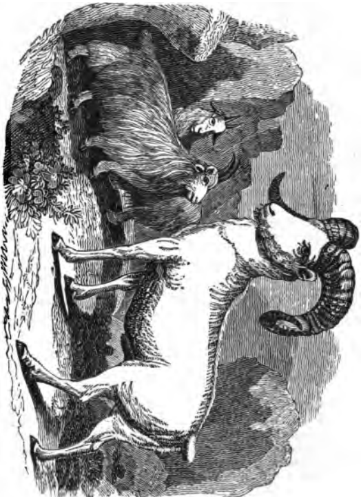
Rocky Mountain Goat, and Rocky Mountain Sheep.